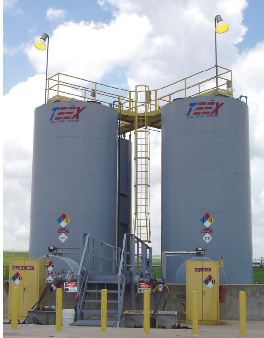
Figure 4.1: Cone Roof Storage Tank

Some larger facilities have built-in fire protection systems. Fixed systems are a combination of devices including foam concentrate storage, proportioning, and delivery devices that are permanently installed to provide fire protection to above-ground fuel storage tanks, manifolds, and loading/unloading racks. The systems can be activated manually or by a detection device. However, if tanks have been converted to store ethanol-blended fuels, the systems may no longer be appropriate. Topside application foam systems may require much higher application rates for ethanol-blended fuels than for previously stored fuels. Subsurface injection systems may not work at all with ethanol-blended fuels. Fire department personnel should be working closely with terminal operators to keep abreast of changes in fuel storage at tank farm facilities.